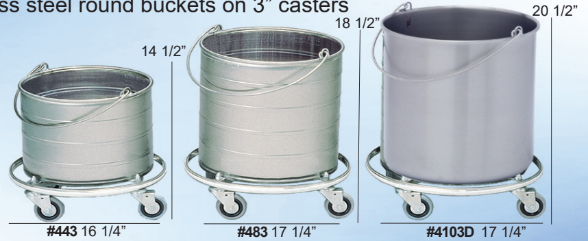
#443 16 1/4" #483 17 1/4" #4103D 17 1/4" 20 1/2" Bucket only 14" diam 10" height 14" diam 14" height 14" diam 16" height Gallon size 4-Gallon 8-Gallon 10-Gallon Casters Four 3" rubber non-marking swivel casters attached with stainless steel tubing spider.