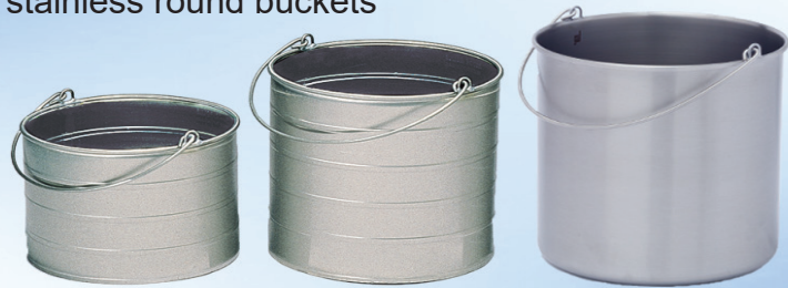
#4 14" diam 10" height 4-Gallon #8 14" diam 14" height 8-Gallon #10D 14" diam 16" height 10-Gallon